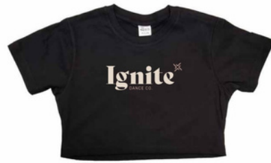
Ignite Cropped Tee - $25 child/$30 adult