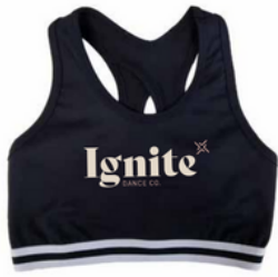
Ignite Crop Top - $45 child/$50 adult