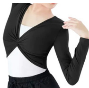
Crossover Top - $39.95 (Pre Teen - Open)