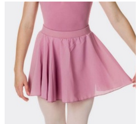
Ballet Skirt - $32 (Pre-Primary & Primary)