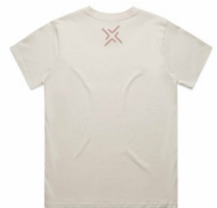
Ignite Tee - $30 child/$40 adult (Adult sizes also available in dusty pink)