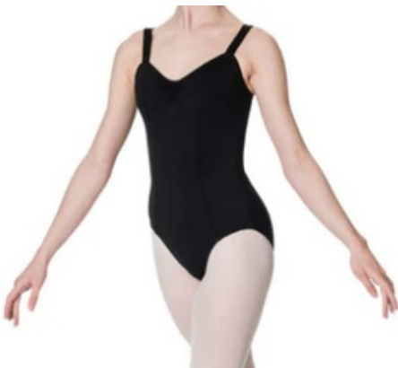
Leotard - $45.95 (Pre-Teen - Open)