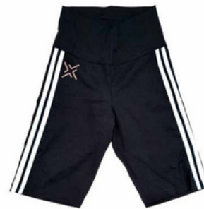
Ignite Bike Shorts - $45 child/$50 adult