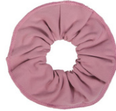
Scrunchie - $10.95