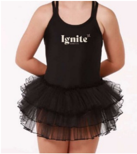
Preschool Tutu - $45