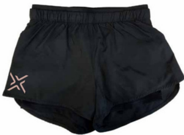
Ignite Jogger Shorts - $40 child/$45 adult