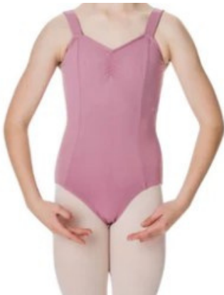
Leotard - $37.95 (child sizes) (Pre-Primary - Junior)

Hair accessories available for all age groups