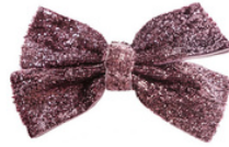
Glitter Bow - $5.95