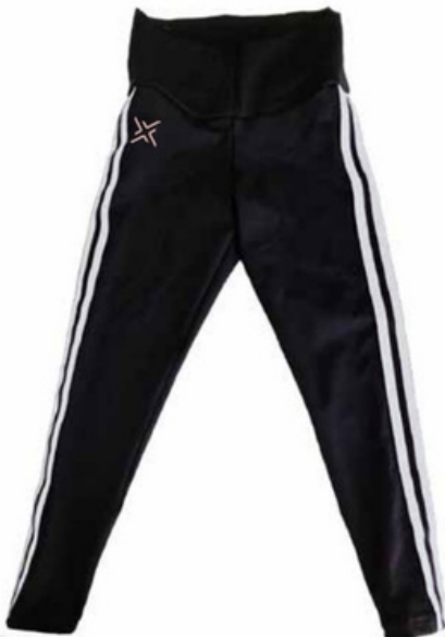
Ignite Full Length Tights - $55 child/$60 adult